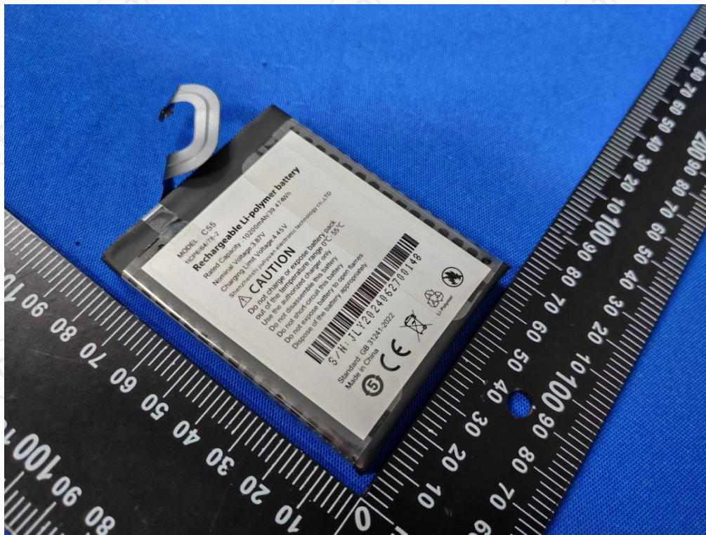
Picture 1. Front view of battery