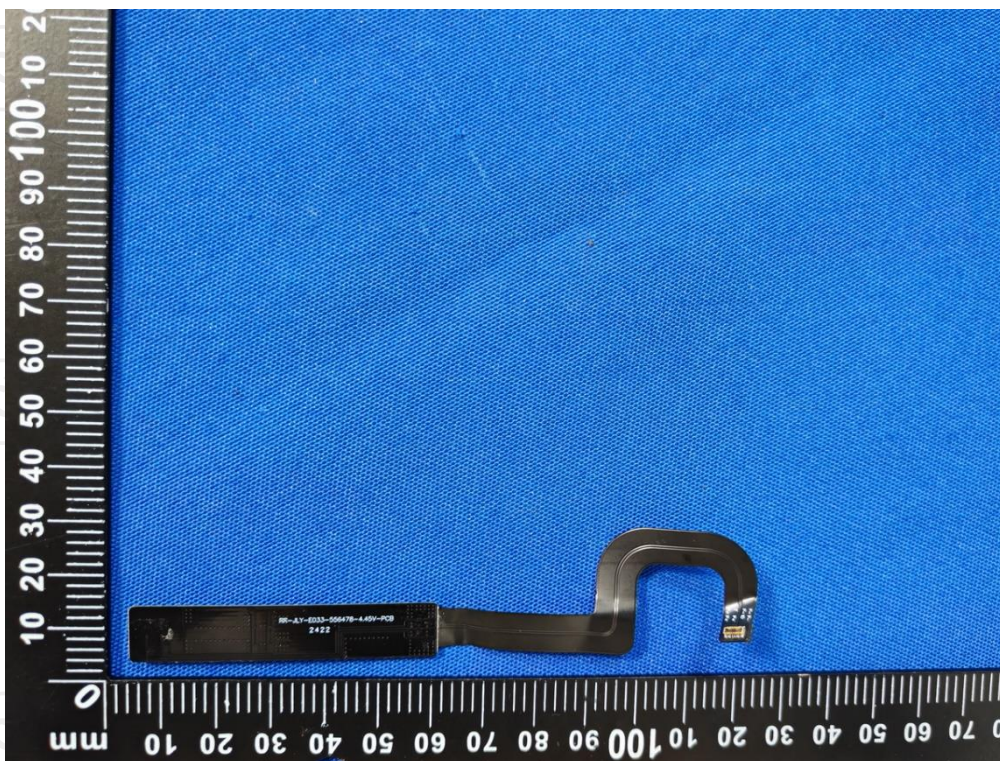
Picture 6. Back view of protection board 图片 6. 保护板后视图