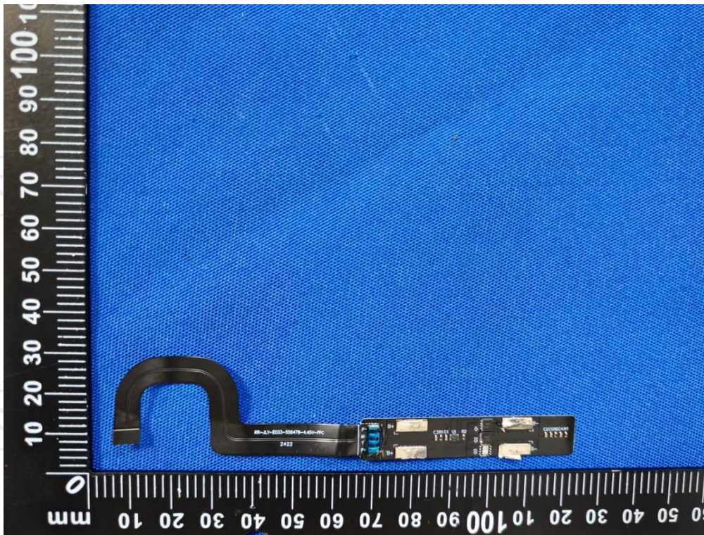
Picture 5. Front view of protection board 图片 5. 保护板前视图