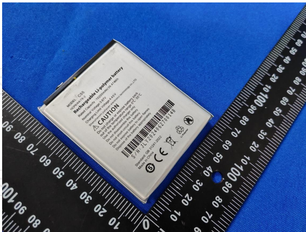
Picture 3. Front view of cell 图片 3. 电芯前视图